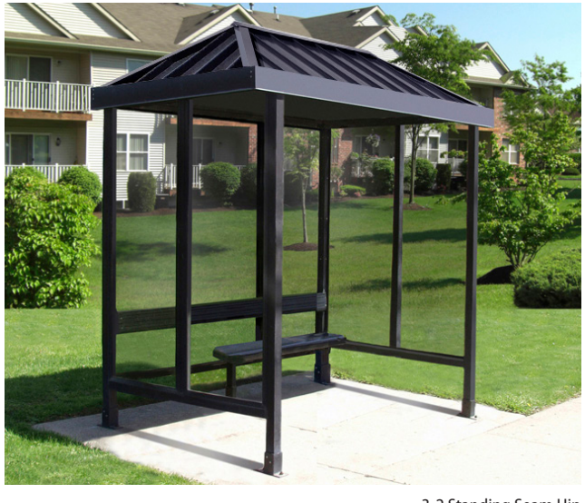
3-2 Standing Seam Hip