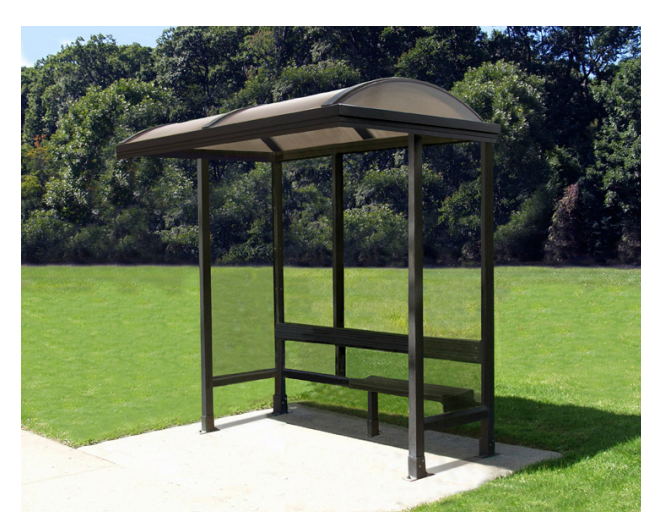
Model 3-1 Barrel